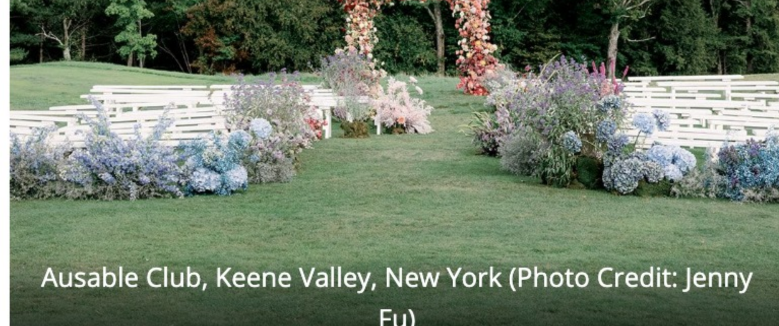
Ausable Club, Keene Valley, New York