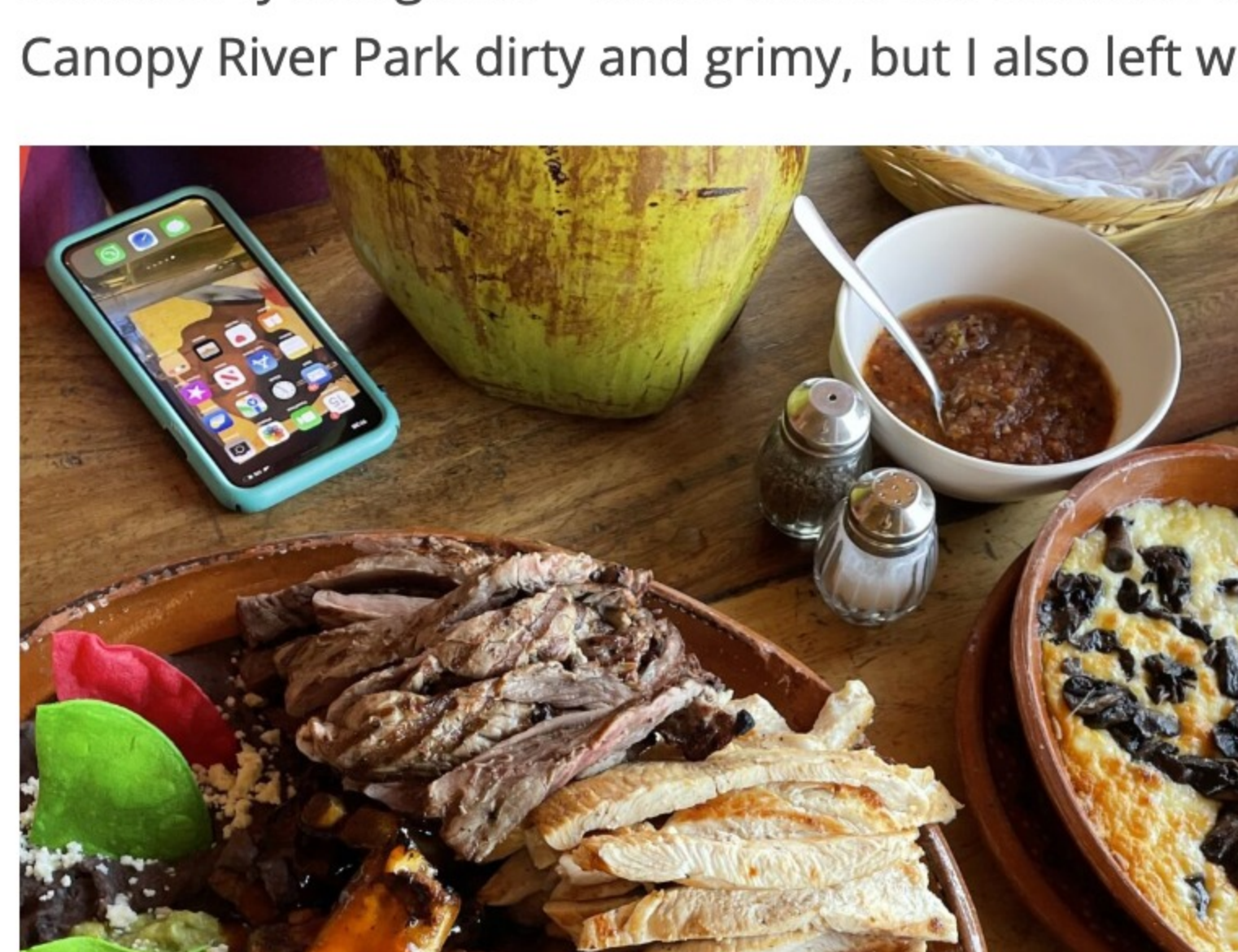
Spread of food for lunch at Canopy River Park

Don't leave Canopy River without ordering one of their margaritas made with fresh fruit. Their strawberry margarita – made with fresh strawberries – was the perfect way to end a fun RZR tour. I left Canopy River Park dirty and grimy, but I also left with a few unforgettable memories.