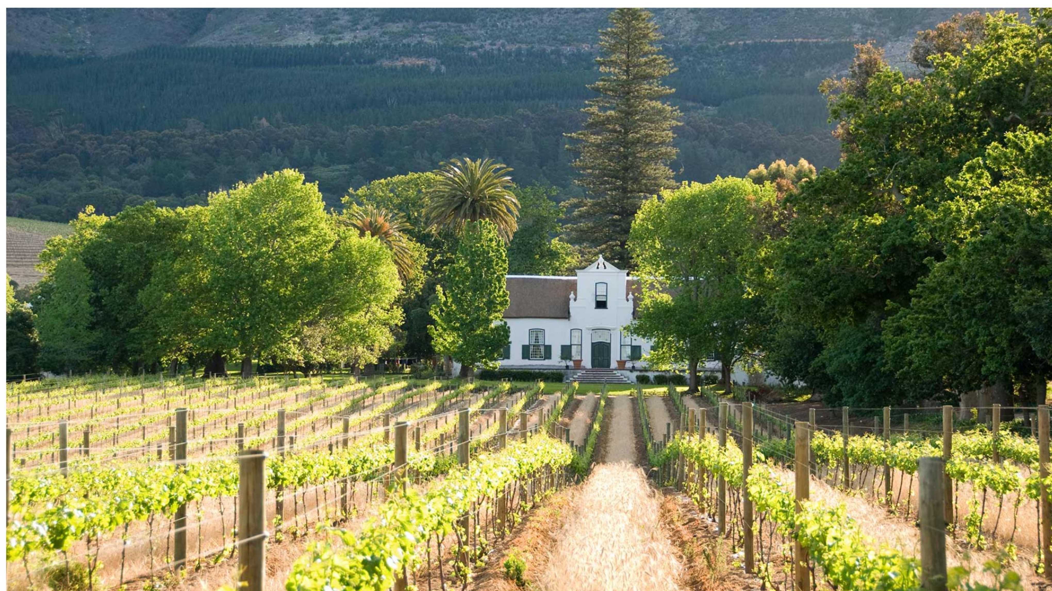
Grab a designated driver and explore wine country.

South Africa's warm and welcoming culture is just one reason why it's a popular destination among LGBTQ+ travelers. Rainbow road warriors should consider the 464-mile drive between Cape Town and Port Elizabeth. Take note, however: A designated driver will be necessary if you plan to visit one or more of the 65 wineries along Route 62.