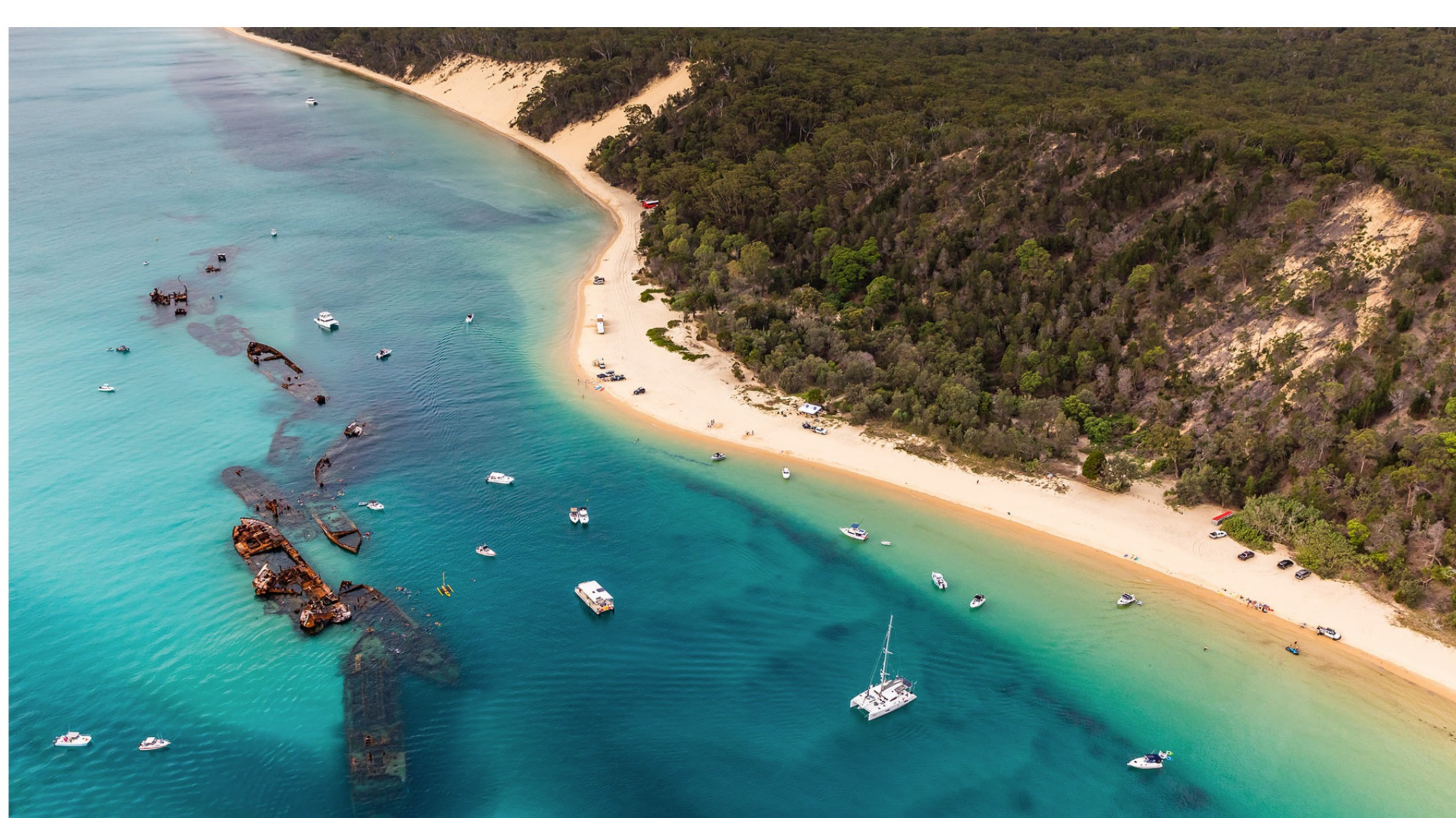
Be sure to pull over and explore idyllic beaches along the Great Ocean Road.

In Australia, the famed Great Ocean Road along the southern coast connects Torquay and Allansford in Victoria. It's an easy two-hour drive, but you may spend most of your time hopping out of the car to take Instagram-worthy photos using the blue waters of the Southern Ocean as the backdrop.